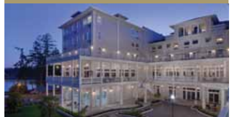
Distinct Style and Plush Amenities