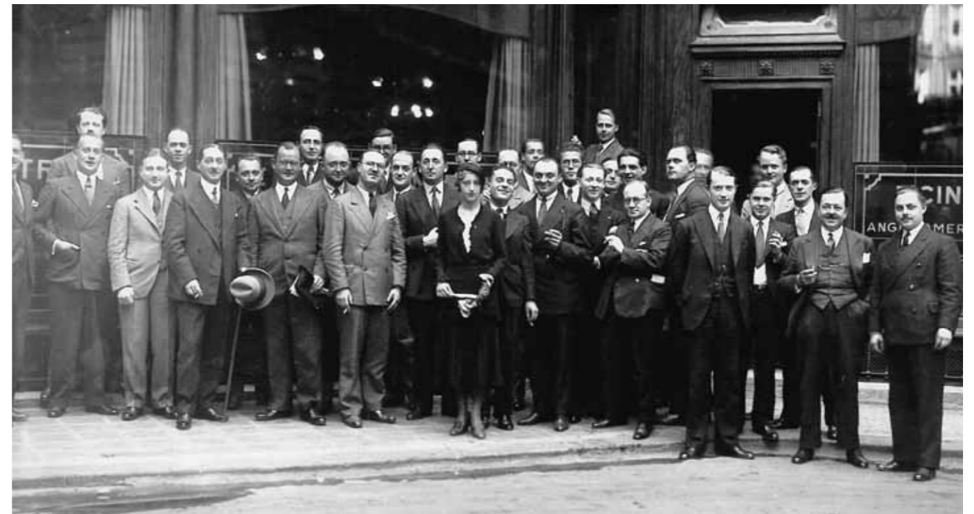
During the XLV Congress in Paris in 1984, all the delegates were given a copy of that postcard featuring the five founders.